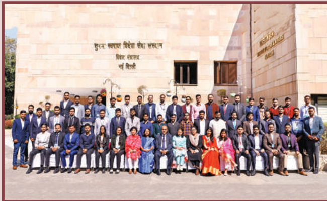
Participants of ITP for Batch-II of DR-ASOs

and drafting, forms of official communication, Conduct Rules, IFS PLCA, gender sensitization, office etiquette, dress code etc. In addition, there were a few sessions on India's culture, polity, economy and globalization, foreign policy, ITEC, Development Partnership Cooperation, Indian Diaspora and emotional intelligence. The programme concluded with a session on Heartfulness Yoga to promote long-term general well-being. The Valedictory Session was held physically at SSIFS during which Certificates of Participation were given to the ASOs. They were invited for a valedictory lunch as a culmination of the ITP.