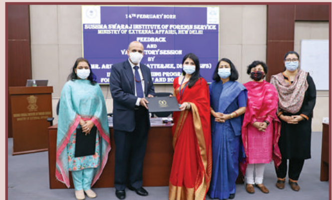
Valedictory Session of ITP for Batch-II of DR-ASOs