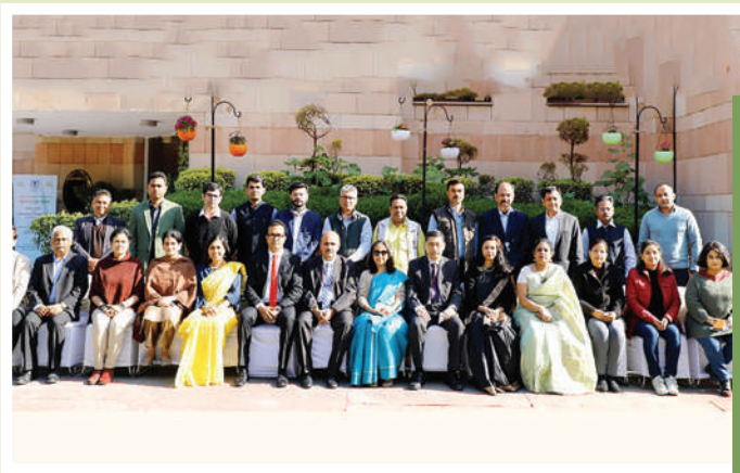
Participants of the Special Course on Foreign Policy for Indian Media

2022 by Smt. Reenat Sandhu, then Secretary (West), MEA. The Special Course included interactive sessions on MEA’s structure and functions, and relevant aspects of India’s foreign policy and diplomatic engagements around the world. Smt. Meenakshi Lekhi, Minister of State for External Affairs & Culture, was the Chief Guest at the Valedictory Ceremony held on 25 February 2022.