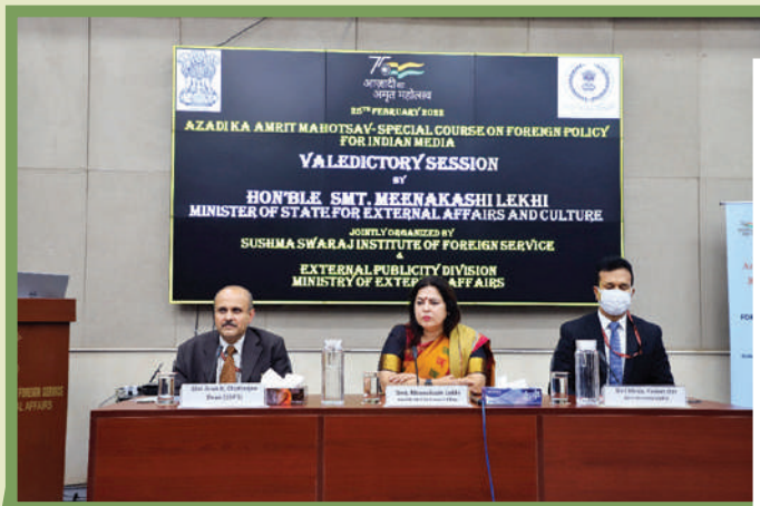
Minister of State for External Affairs & Culture, Smt. Meenakshi Lekhi graced the Valedictory Ceremony